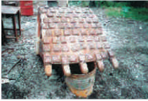
Earth moving bucket

Typical Application: Liners / Components which are subjected to Abrasion / Impact (Screens in Steel Industry)