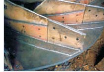
Blade Liner for Fan impeller

Typical Application: Liners / Components which are subjected to high Abrasion / Impact.