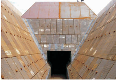
Ore handling liner plates